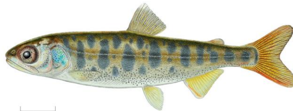
Chinook parr