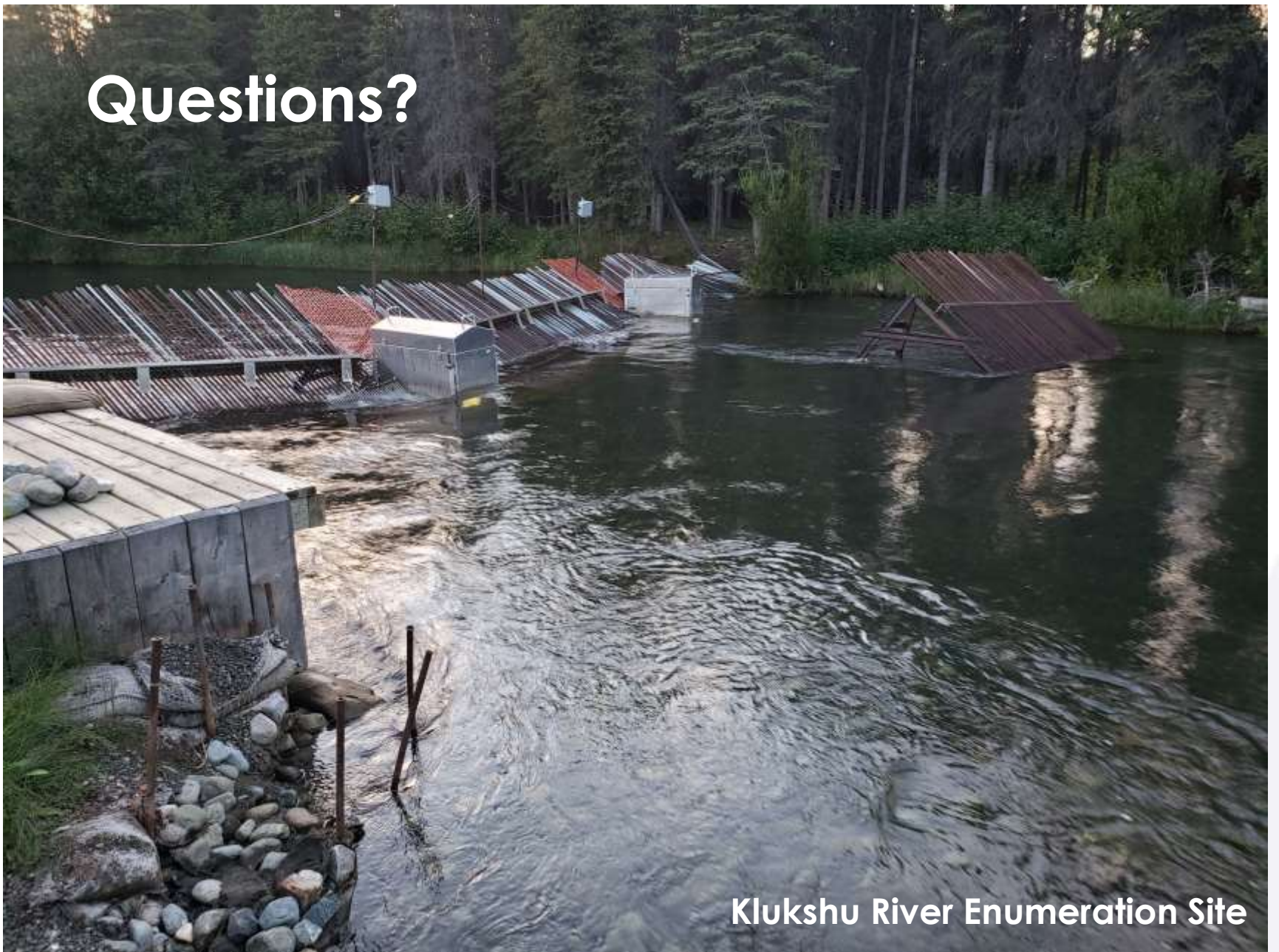
Klukshu River Enumeration Site